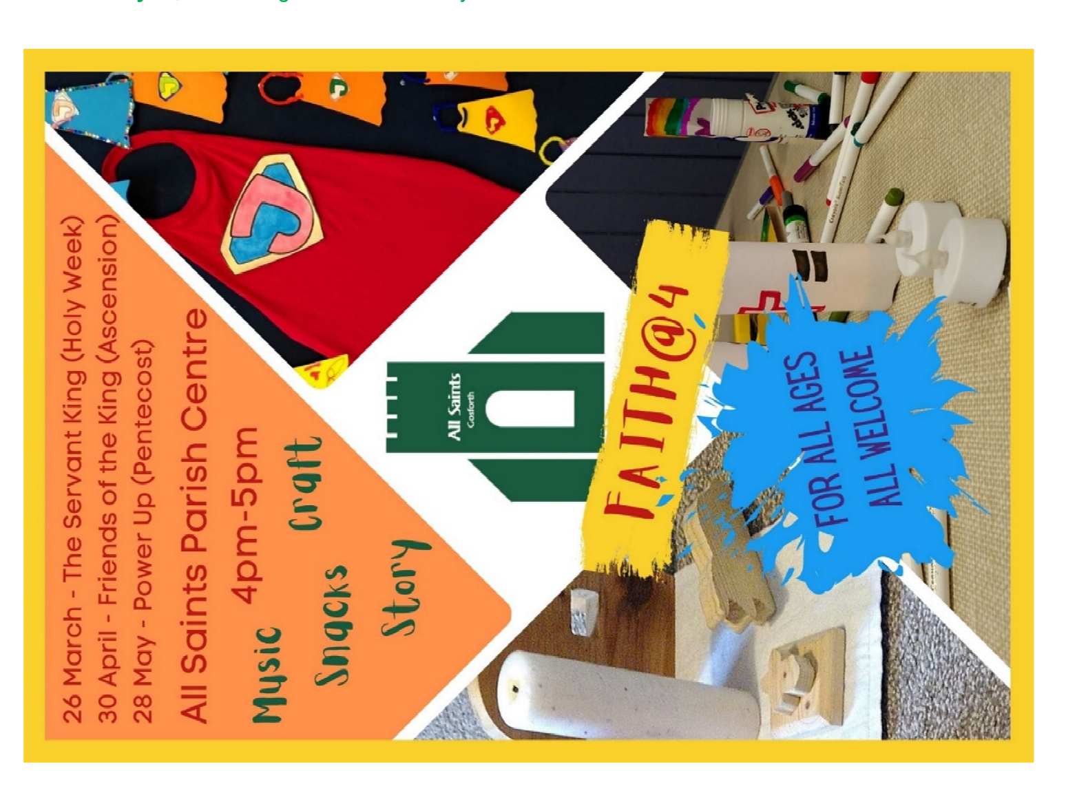
Thank you , for looking at our news today.