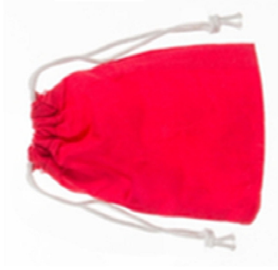
Suggested size: 45cm x 35cm