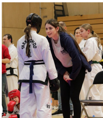
Taekwondo National Tournament Northumbria University