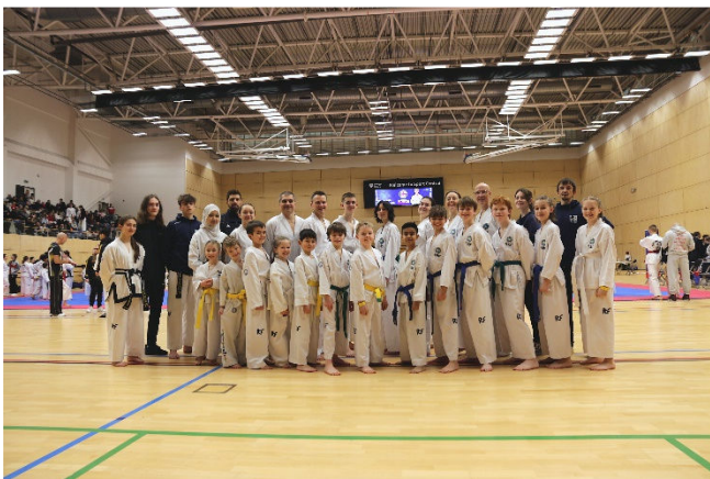
Taekwondo National Tournament Northumbria University

We have had another very successful year. The motivation behind the academy is to promote social cohesion through the practice of Taekwondo. Our mission statement is 'self-development through self-defence', and through that we aim to help mould our students into kind and caring people who contribute to their community – but who can also defend themselves if need be. We are heartened by the age range of our classes – from four years old to well, could I put it to over 65! Many of our senior black belts have been training at the academy for well over