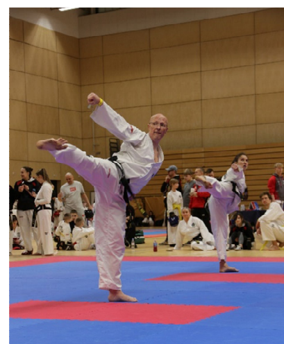
Taekwondo National Tournament Northumbria University

twenty-five years, which means we are doing something right. One of the highlights this year was two 16-year-old young women who attained their first degrees after training for over ten years – they started in the schools programme at South Gosforth first school and have come through the Taekwondo kids programme and then the Taekwondo syllabus. We are so proud of our young people – It takes a lot of dedication to get a black belt. It gives them a sound grounding in exam skills as well as life skills. We have a large number of young people who volunteer to teach the little children and many who use Taekwondo as their Duke of Edinburgh physical or volunteering awards.